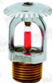
Upright Type Sprinkler