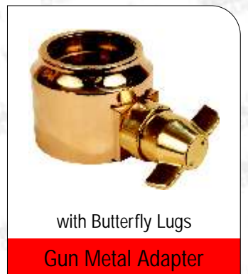
with Butterfly Lugs Gun Metal Adapter