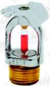
Sidewall Type Sprinkler