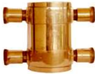
Double Female Adapter