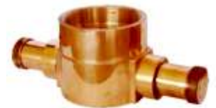
Adapter Double Female Lugs