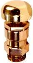
Gun Metal Air Release Valve