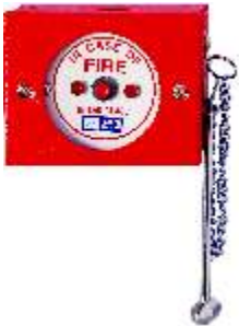
MS Manual Call Box