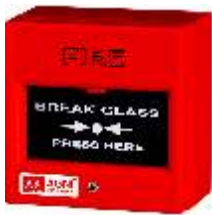
ABS Manual Call Box