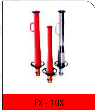
FX - 10X