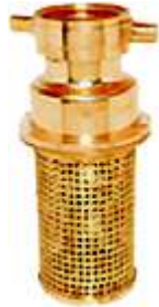
Foot Valve Strainer