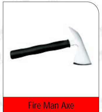
Fire Man Axe