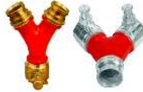
Gun Metal & Aluminum