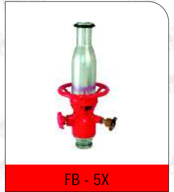
FB - 5X