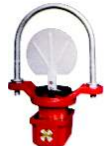
Water Flow Indicator