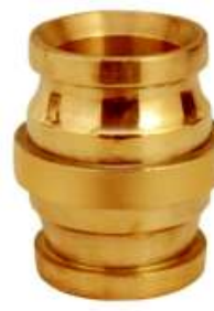
Double Male Adapter