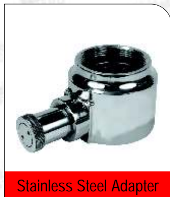
Stainless Steel Adapter