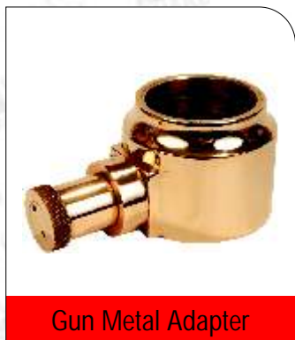
Gun Metal Adapter