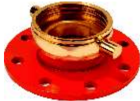
C.I. Draw of Connection