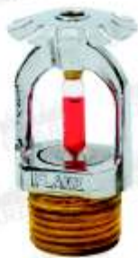
Pendent Type Sprinkler