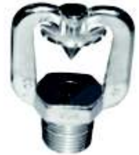
Sprinkler MV Spray Nozzle