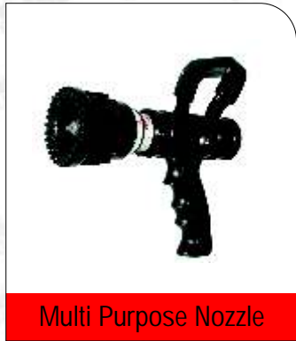
Multi Purpose Nozzle