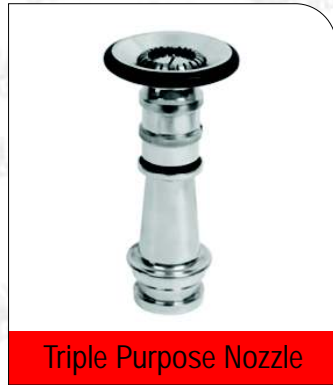
Triple Purpose Nozzle