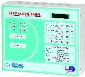
Fire Alarm Panel